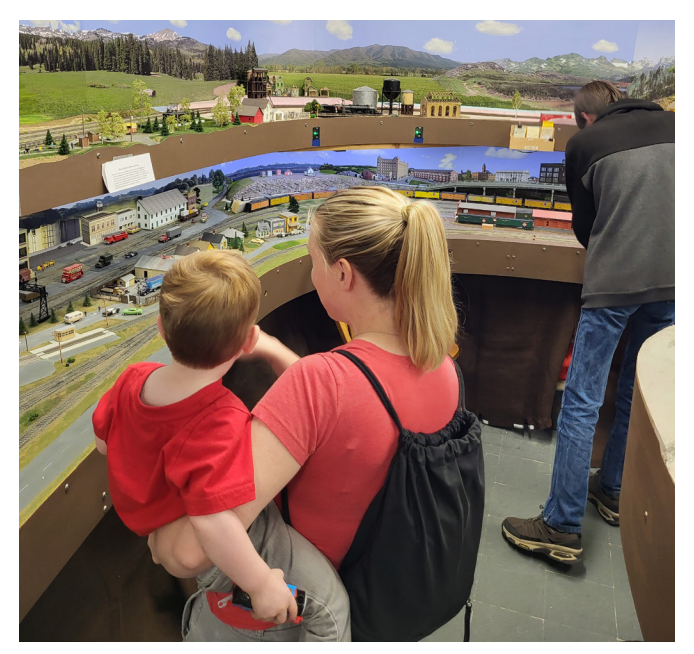
Visitors enjoying the Boeing layout during "Arts-a-Glow".

We have also begun process development for recording accession records into AtoM. Data from the 700 accessions at PNRA and 350 at Jackson Street Roundhouse are being reviewed for transfer. During August and October visits to St. Paul, data transfer, accession records and transferring the 110,000 Great Northern AFE records were planned.