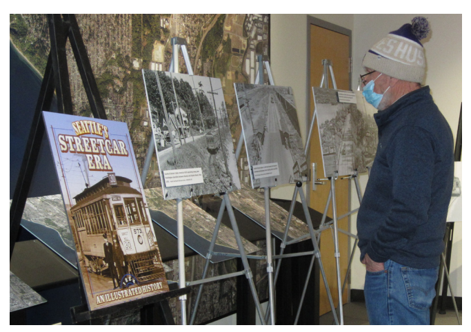
A visitor at the Highline Heritage Museum viewing some of the photos found in the Seattle Streetcar Era book.

Seattle Streetcar Era, An Illustrated History. A display of large photos from the book was set up in the museum lobby for the event and local bookstore Page 2 Books had books available. All the photos in the book are from the Walter Ainsworth collection at PNRA. Over fifty people enjoyed the event.