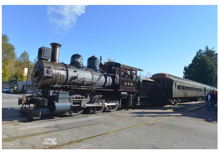
Northwest Railway Museum's 924 guides its first passenger train since restoration, across a street crossing in Snoqualmie, Wash.

the right-of-way between Roy and Yelm, WA to help complete the bike trail and resolve some land questions.