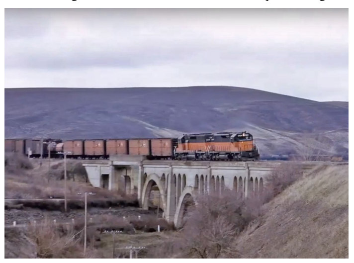
As shown during the 2020 Bridge Day virtual lecture, Milwaukee Road Train 264S crossing the concrete arch bridge east of Rosalia, Wash. on Feb. 12, 1974.

Scott Bigelow was sent a set of valuation maps showing