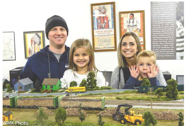
A family enjoys the trains running on the BEMRR's modular layout in the Archive's main work room during our Annual Open House over the 2018 Thanksgiving Weekend.