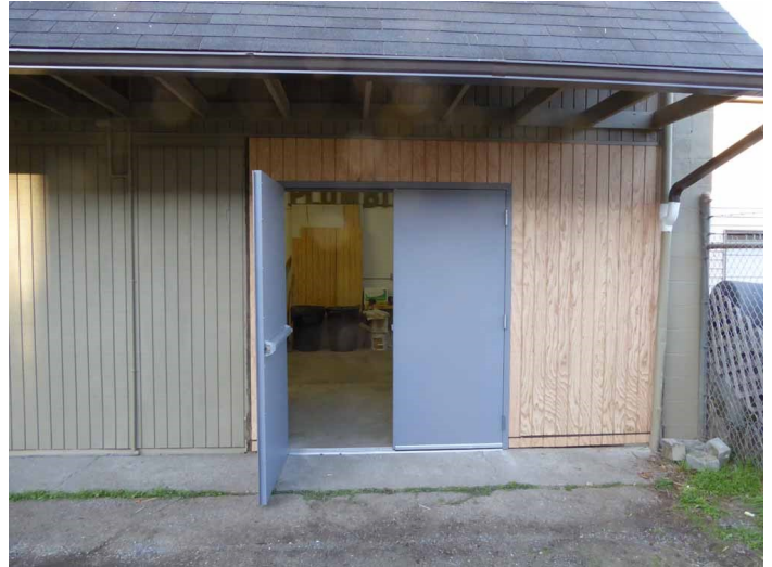
The rebuilt wall around the new steel doors in Receiving which is under the south awning which routes water away from the building.