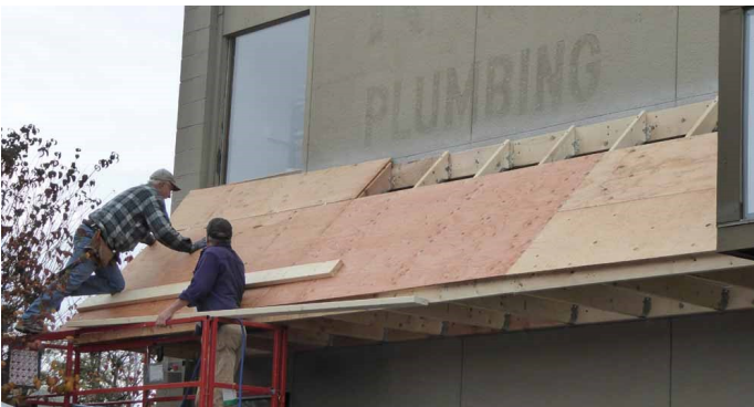
Bill Petyrk & Rod Olson apply plywood sheathing to the frames of the north awning which will keep this side of the Archive dry.