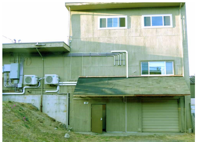
The installed awning on the Archive's south side. Note the new climate control compressors to the left of the awning.