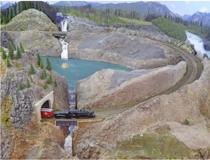
The Concrete Local passes over a falls at Crater Lake on BEMRRC's permanent layout at PNRA. The layout will be a major feature of the 2017 Holiday Open House on Nov. 24-26 from 10:00 AM to 4:00 PM.

We are pleased that three PNRA members have indicated that they have included a planned gift to PNRA in their will, with others expressing interest in making a planned gift. The PNRA Headlight Society was formed to honor individuals who make such a commitment to PNRA in a will, regardless of the gift's size. These planned gifts will fund the financial foundation of the Archive and ensure PNRA's preservation mission continues into the future.