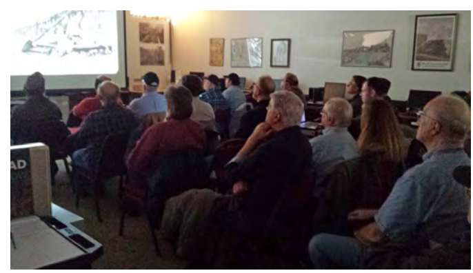
Nearly 50 Milwaukee Road fans attended their meet in March on PNRA's main floor work room.

Over the last thirteen months our mortgage debt has been reduced by $191,706 and now stands at $283,294. With your help, we can reduce this debt significantly and allow the Archive to do more preservation with our operating revenue. Please help us by making a contribution now from the Donate Now link on the Home page of our web site below.