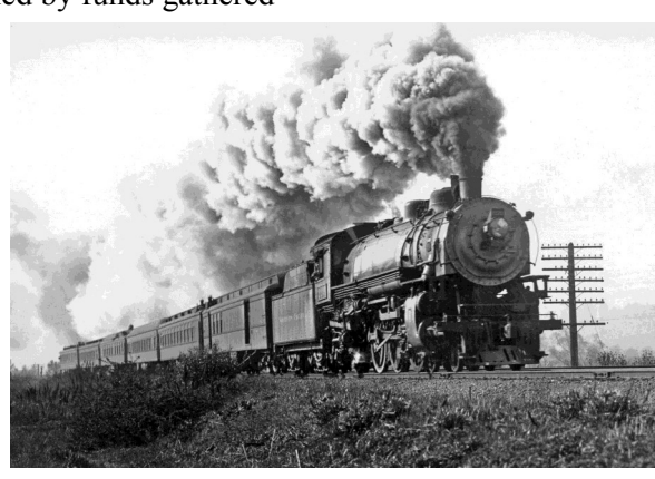
An NP Class Q5 Pacific at Seattle