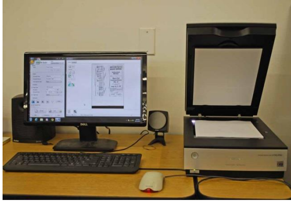
New slide and negative scanner

PNRA purchased an Epson 750 photo negative and slide scanner with a portion of the grant from 4Culture , the King County Heritage and Cultural funding agency. This unit scans up to twelve slides automatically at a time. It also is able to scan up to 8" by 10" negatives, in addition to 35 MM negative strips.