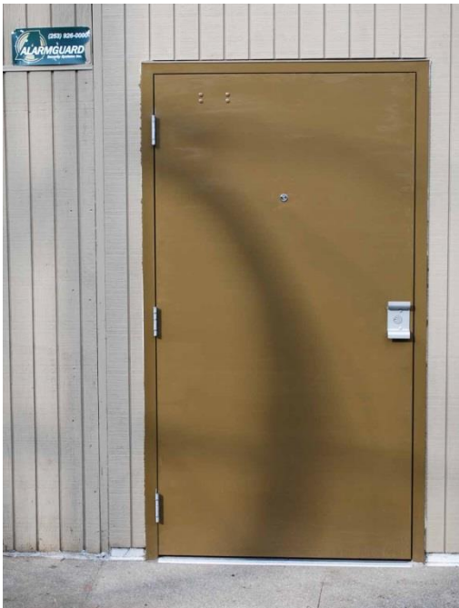
New entry door into Receiving

The new steel entry door in the Receiving area on the lower floor now allows entry from the rear of the Archive. The parking area at the rear of the building is now being used during our weekly work sessions.