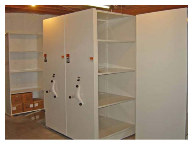
Head-end of PNRA's new Mobile Shelving installation

On June 20, 2012, the Borroughs Corporation and Sound Business Systems completed the installation of our mobile shelving systems on the lower floor of the Archive. It was purchased with project funding awarded last October by the North American Railway Foundation of Harrisburg, Pennsylvania. Crews are now moving the cataloged boxes onto the shelving which frees work space to sort collection received since the Archive opened.