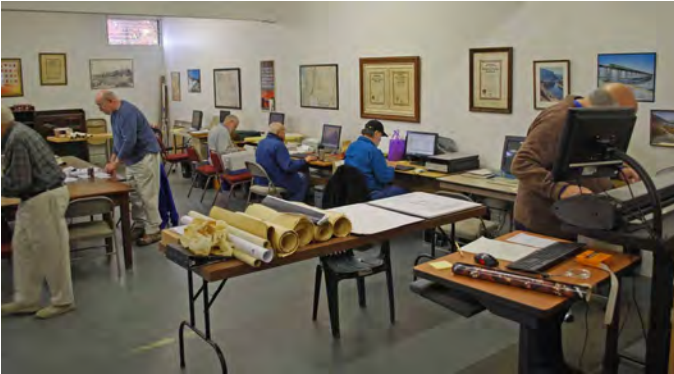
Part of Wednesday crew in action on main floor

The Tuesday Crew started weekly work sessions in June, meeting each week from 10:00 AM to 4:00 PM. The Saturday crew works on the 2nd and 4th week from 10:00 AM to 4:00 PM. The Wednesday crew continues to meet each week 10:00 AM to 4:00 PM with crews ranging from ten to fourteen volunteers each session. The Thursday Evening crew meets the 1st and 3rd from 6:30 PM to 10:00 PM.