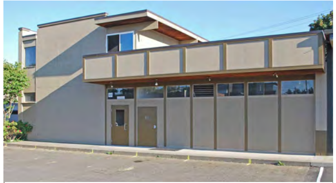
Archive facility with new steel door with window.

The wall on the Main floor has been completed between the Boeing layout space on the west side of the main floor and the Archive work space on the east side and looks great. The wall is insulated to reduce